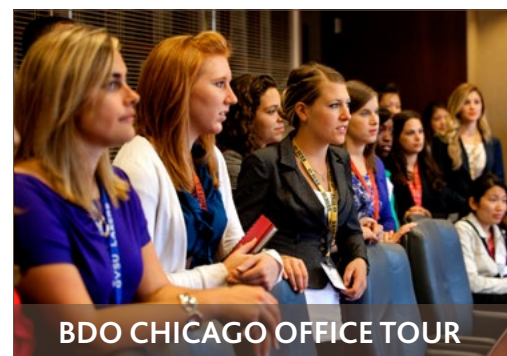
BDO CHICAGO OFFICE TOUR

BDO USA, LLP, a Delaware limited liability partnership, is the U.S. member of BDO International Limited, a UK company limited by guarantee, and forms part of the international BDO network of independent member firms. BDO is the brand name for the BDO network and for each of the BDO Member Firms.